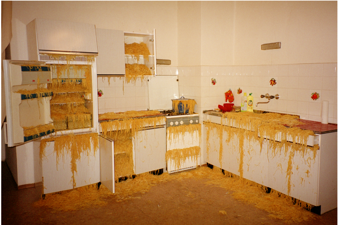
Heute bleibt die Küche kalt, wir gehen in den Wienerwald (Today the kitchen's cold, we're going to the Vienna woods), kitchen, spaghetti (installation: Vienna), 4 photographs, each 70 x 105 cm, 2004