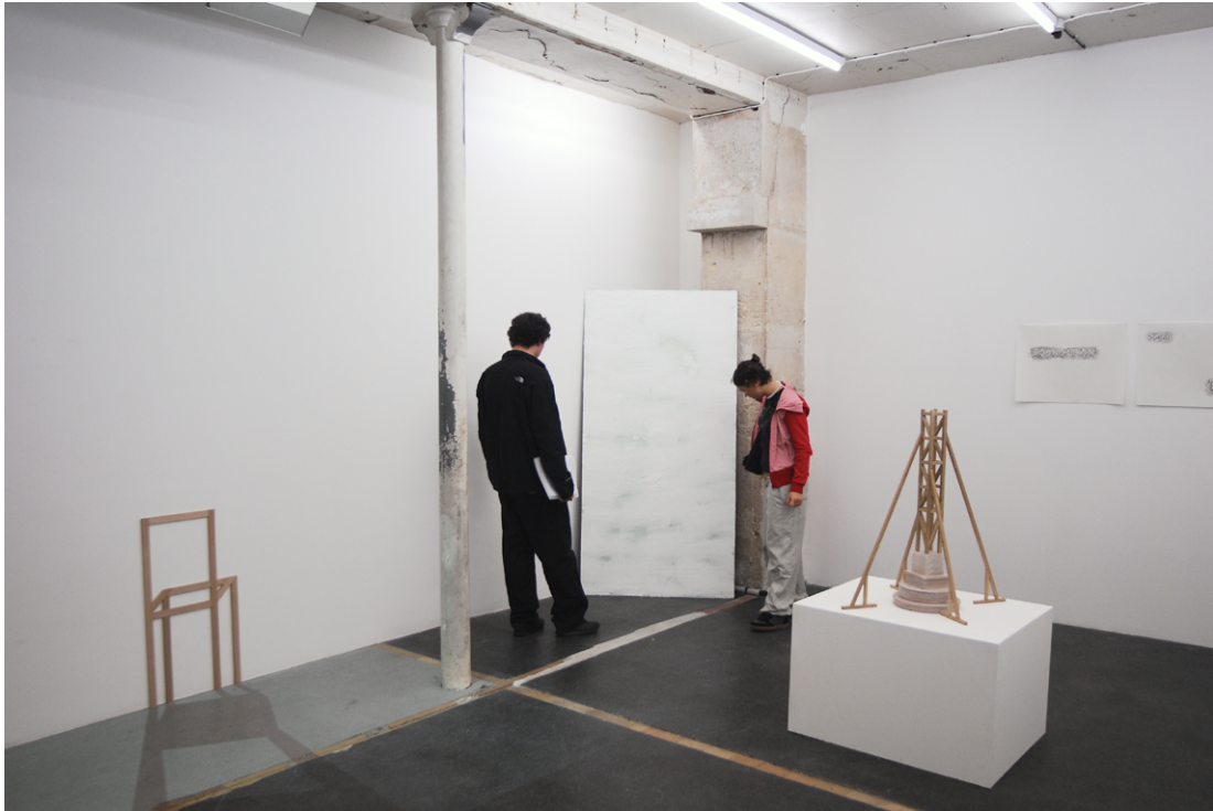
La Grande Marlène , mirror, Nivea Creme, 100 x 200 cm (installation: Galerie Jocelyn Wolff, Paris), 2006