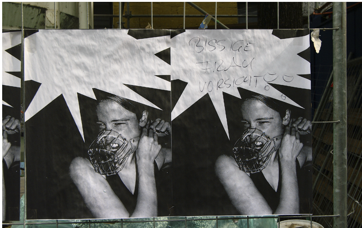
Cheek Up! , Poster to put up in public, Vienna, 2005, Prague, 2006, Crakow, 2008