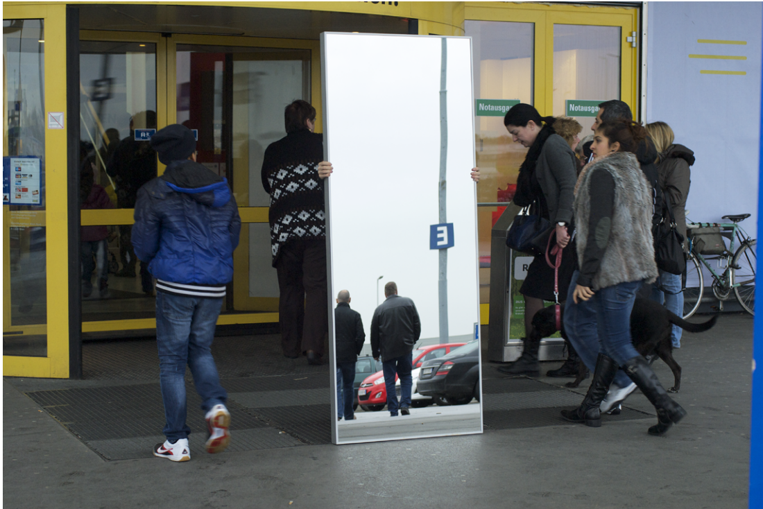
Mirror Holdings (Spiegelgesellschaft) , full-length mirror, various locations, Vienna, 2012