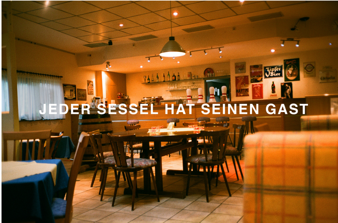
Living in Hope , three-week performance (for the Festival of Regions) as permanent regular in a local pub on the outskirts of Linz, Tornado Bowling Restaurant, 9–31 May 2009 [postcard, 104 x 147 mm, 2010]