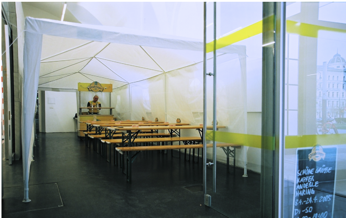
Mein Bier. Dein Bier. (My beer. Your beer.) , beer tent, bar, 2 blackboards, 4 tables, 8 benches, 12 ashtrays, 96 beer mugs, 150 litres of beer, drinkers (installation: Quartier 21, Museums Quartier, Vienna, 2005)