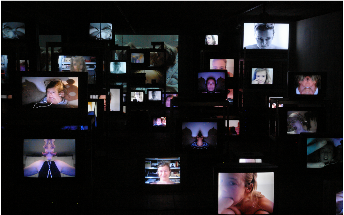
Photoboothautograph , 38 two-image-videoloops, 38 monitors and projectors (installation: Künstlerhaus Passagengalerie, Vienna), 2009