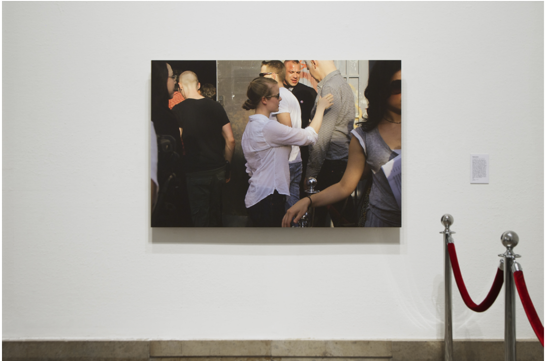
Door Policy ... , offset litho mounted on wood, 163 x 109 cm, rope and post barriers, hidden sound source (installation: Künstlerhaus, Vienna), 2011