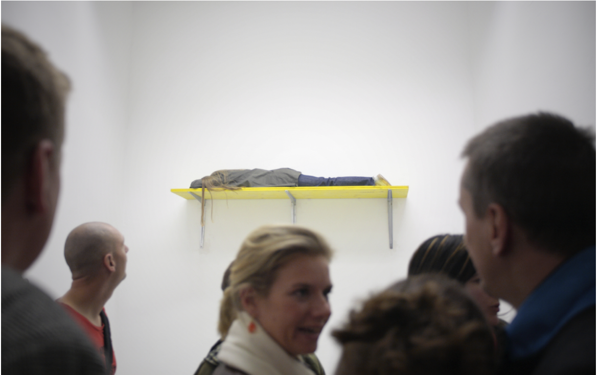
Never Mind Shelf (Regal Egal) , 3-hour performance, wooden planks, shelf brackets, 200 x 50 x 60 cm (3-part installation/performance: Galerie Mezzanin, Vienna), 2005