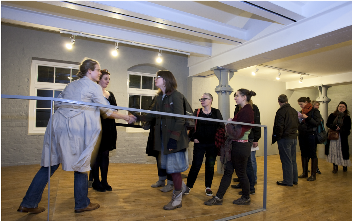
Girl Chewing Gum , 40-minute performance, Modern Art Oxford, 26 November 2010