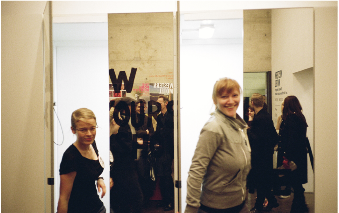
Show Me Yours, I'll Show You Mine , mirror wardrobe, marker pen, button badge (performance/installation: The Porn Identity , Kunsthalle Wien, Vienna), 2009