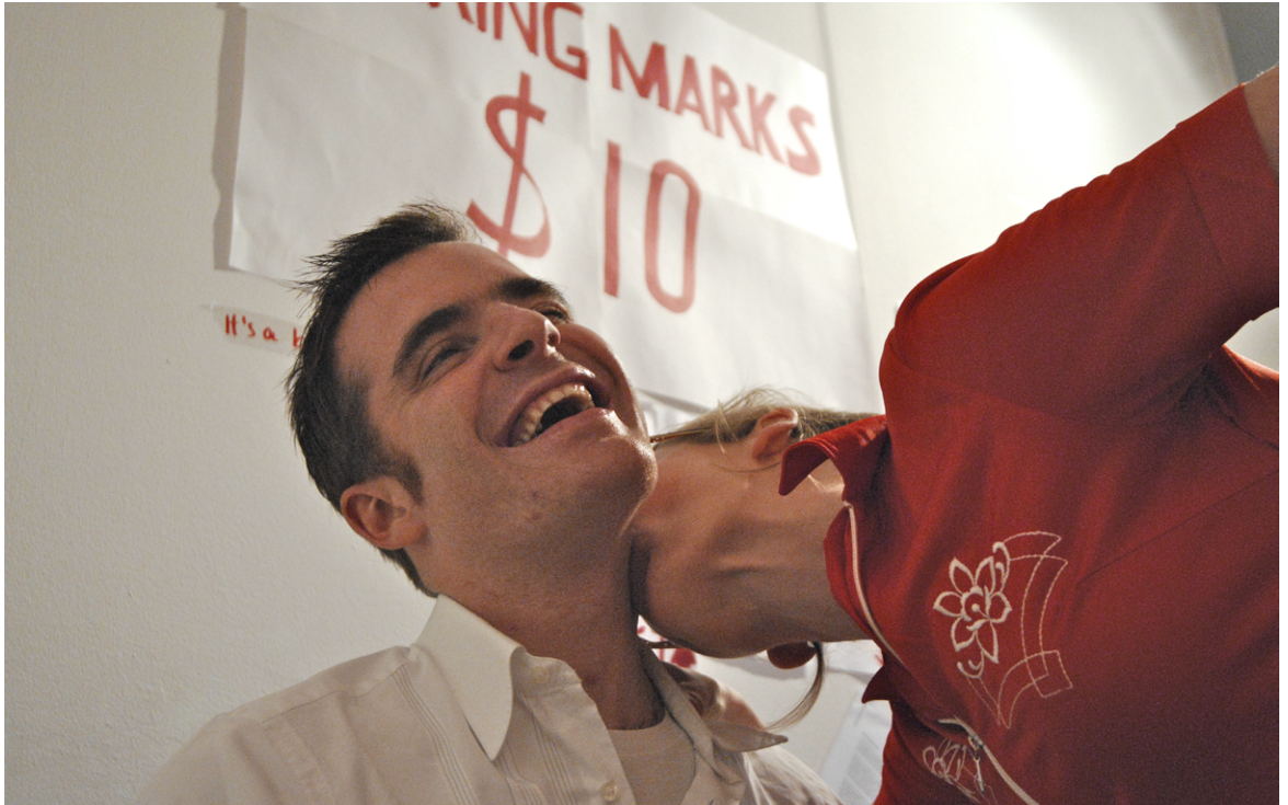
Sucking Marks $10 , commercial service, Scope Miami, 6–10 December 2006