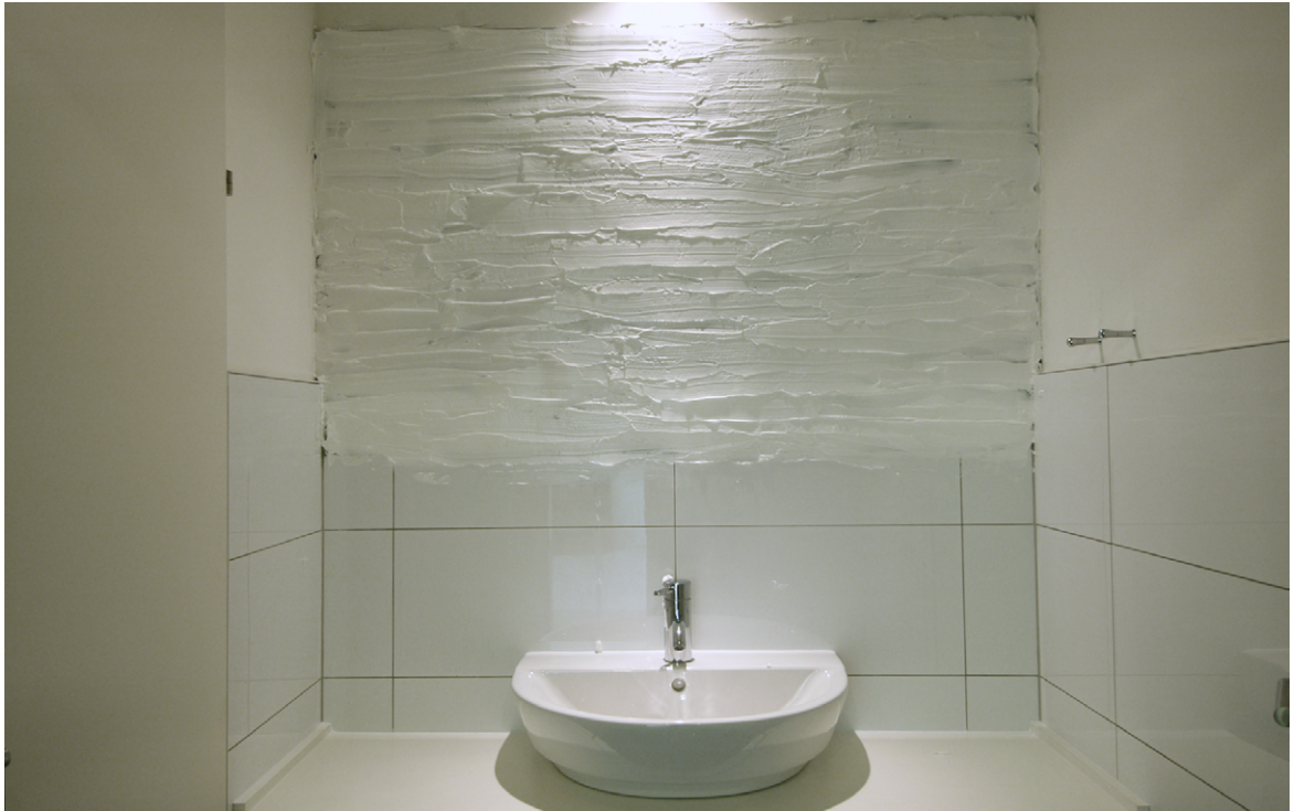
It's All a Façade (Alles Fassade) , washroom with mirror, Nivea Creme (3-part installation/performance: Galerie Mezzanin, Vienna), 2005