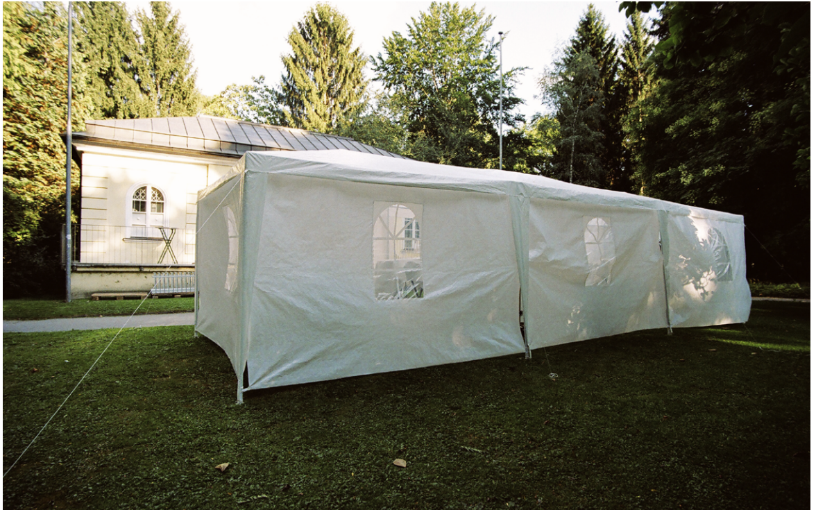
Hast ein Kaiser. Bist ein Kaiser (If you have a Kaiser, you are an emperor), beer tent, bar, blackboard, 8 tables, 8 ashtrays, 100 beer glasses, 100 litres of Kaiser beer, drinkers (installation: Kunstpavillon Innsbruck), 2005