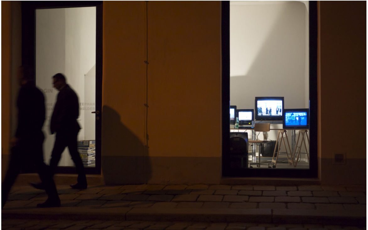
Lickingglass (Geschlecktes Glas) , licked glass, uncut video, (installation, Galerie nächst St. Stephan, Vienna), 2010