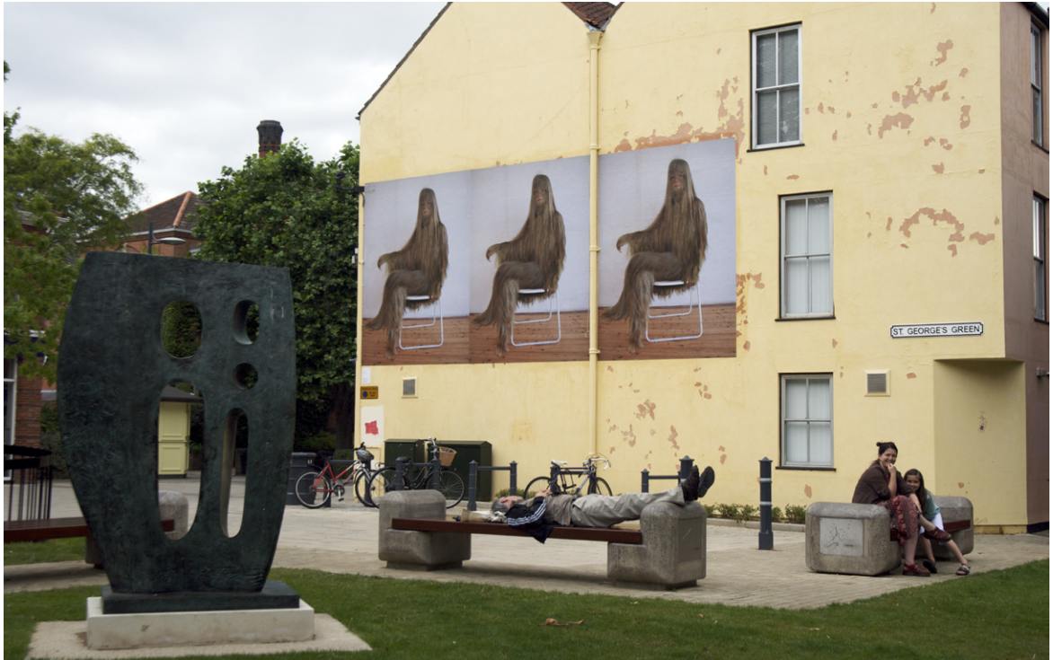
Because Every Hair is Different ( Weil jedes Haar anders ist! ), billboard posters, each 357 x 252 cm (installation: East International , Norwich), 2009