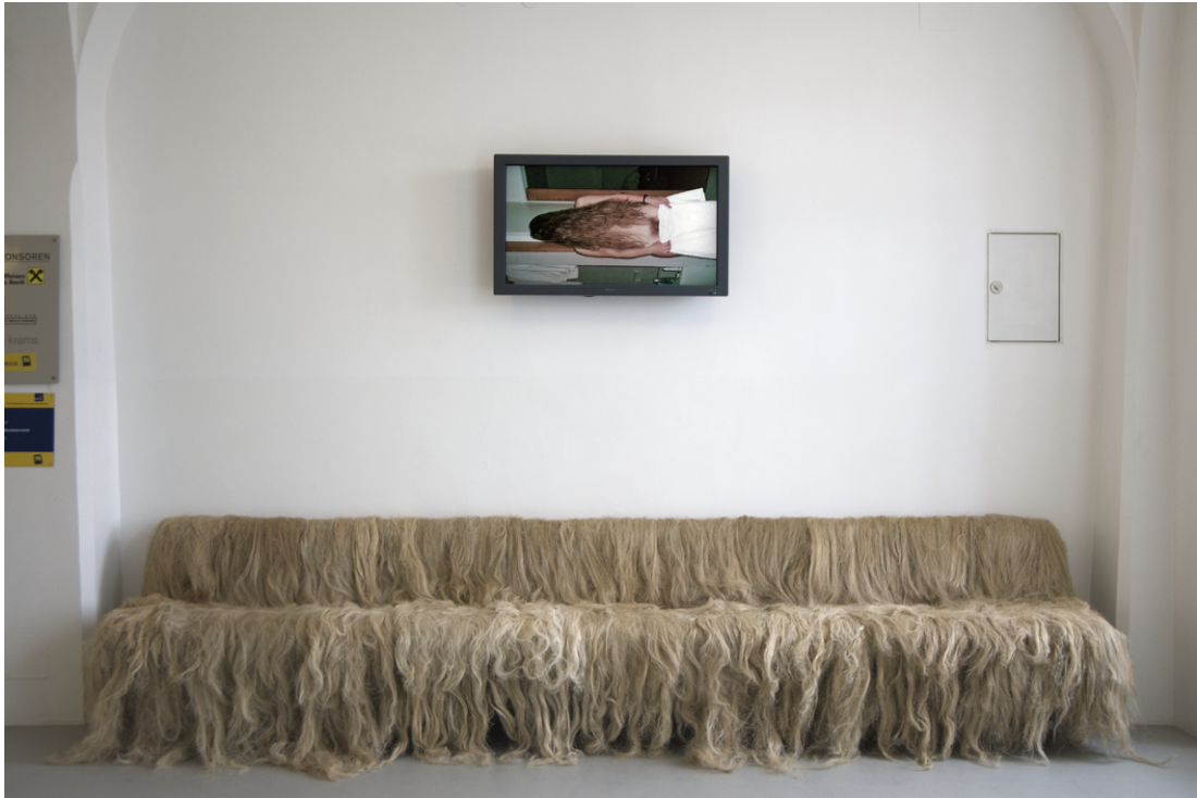
Letting My Hair Grow , lobby, video monitor, bench, plumber's hemp (installation: Kunsthalle Krems, Austria), 2009