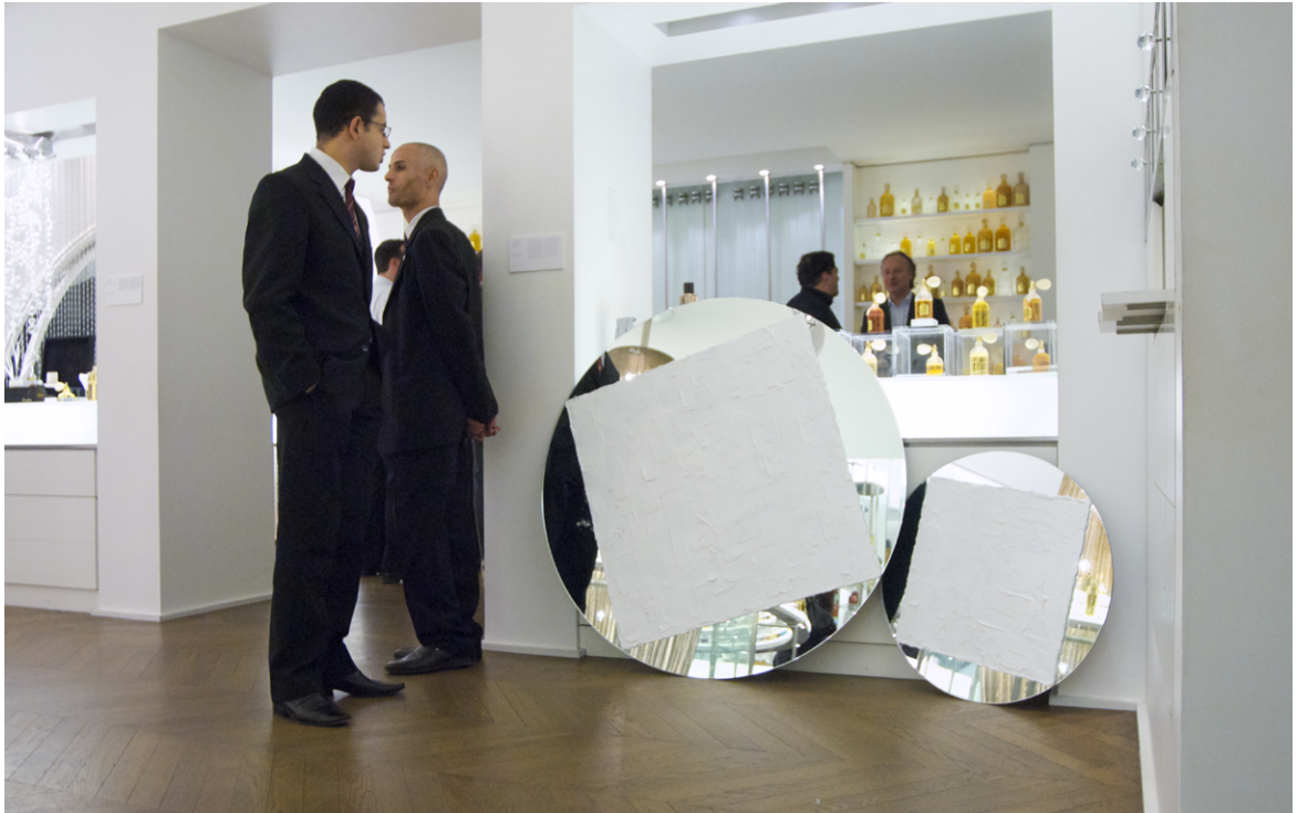
3 Marlènes Carrées (3 Square Marlènes ), set of 3 round mirrors, diameters 160 cm, 70 cm, 30 cm, each inscribed with a square of Nivea Creme (installation: Miroir mon beau miroir , Maison Guerlain, Paris), 2007