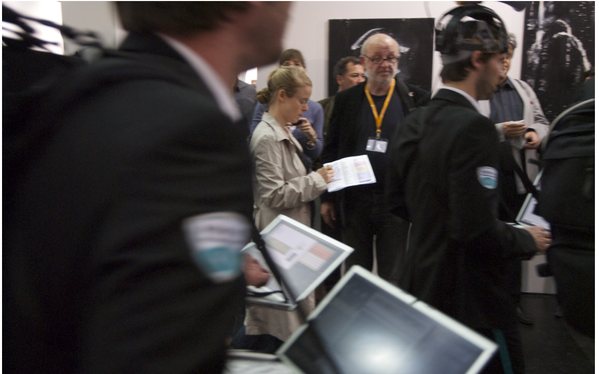
All Quiet on the Western Front (Im Westen nichts Neues) , performance, repetition, Vienna Fair: Internationale Messe für zeitgenössische Kunst mit Fokus Zentral- und Osteuropa, Vienna, 7 May 2010