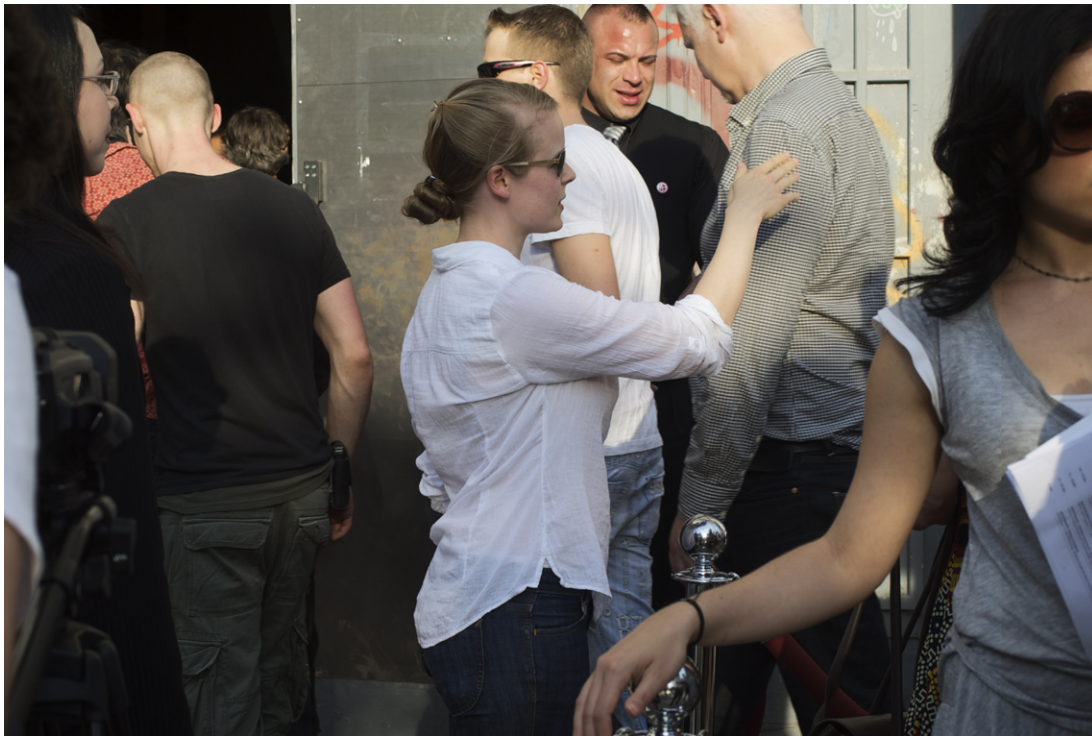
Door Policy .... , offset litho mounted on wood, 163 x 109 cm, 2011