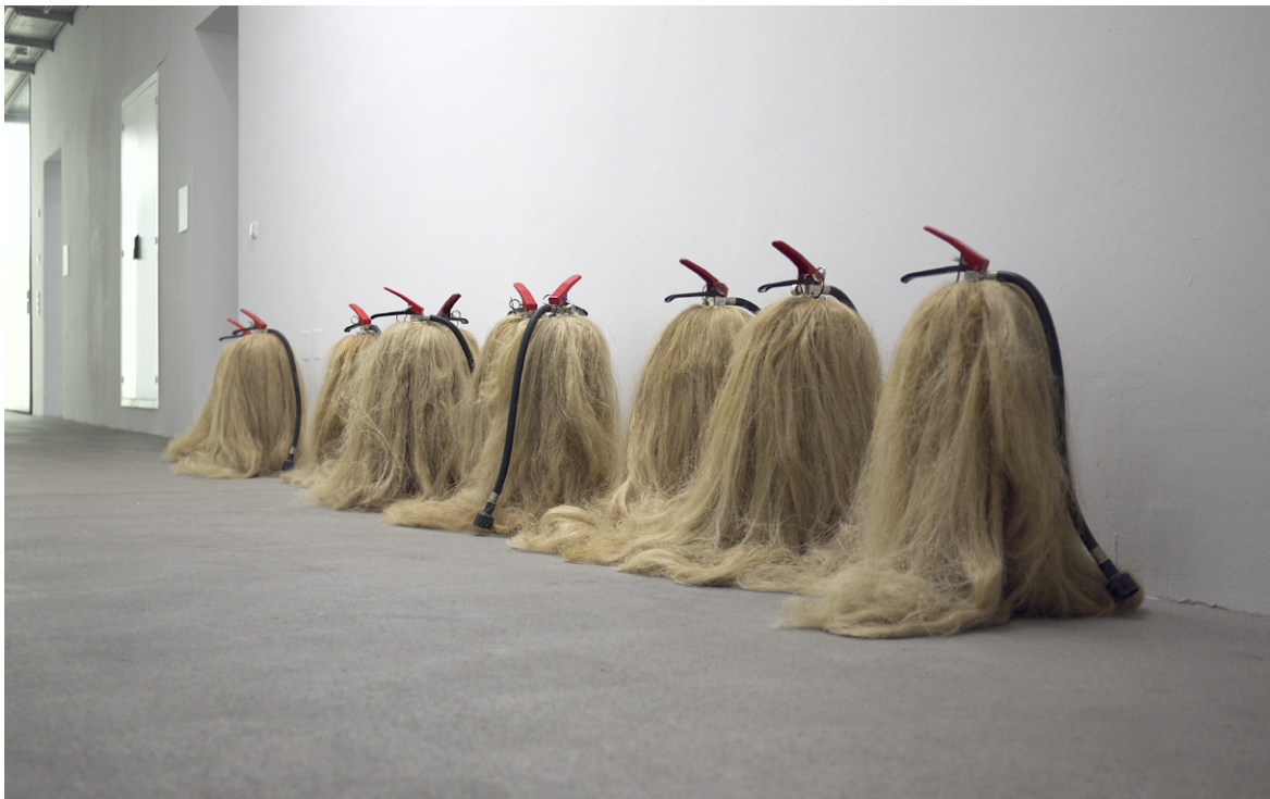
Hair Extinguisher ( Haarlöcher ), 10 fire extinguishers, plumber's hemp (installation: Triennale Linz, OK Center for Contemporary Art), 2010