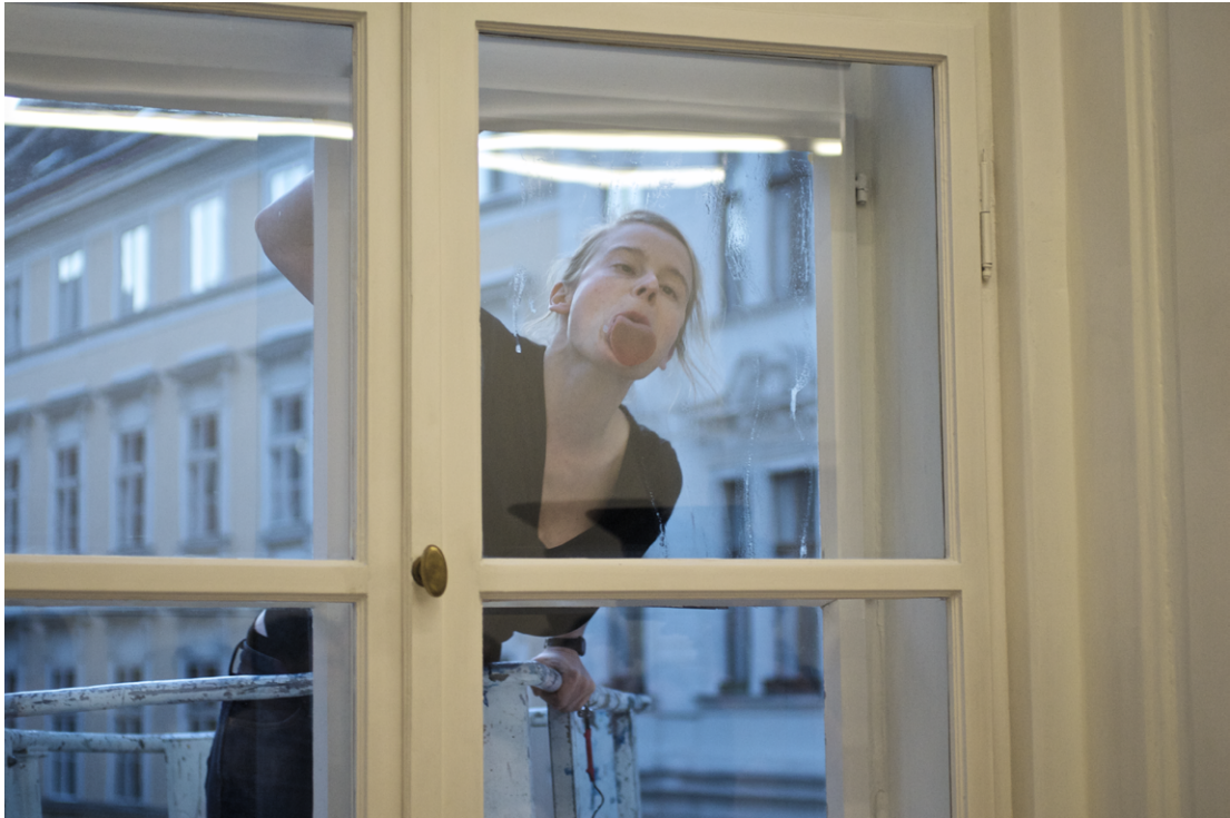
Lickingglass (Geschlecktes Glas) , windows, saliva, cherry picker, camera men, 30-minute performance/installation, Galerie nächst St. Stephan, Vienna, 6 May 2010