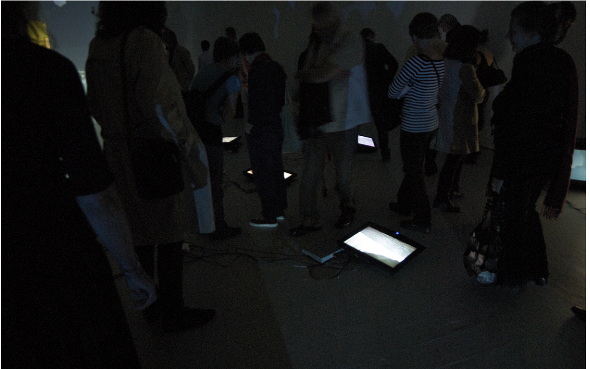
I won't paint myself into a corner (In die Ecke laß ich mich nicht drängen) , video loops, monitors, projectors, LOUD speakers (installation: Kunsthalle Krems), 2009