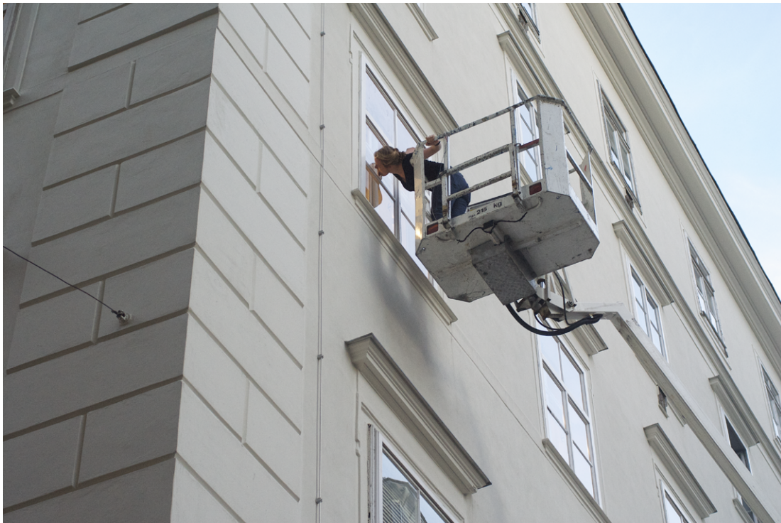
Lickingglass (Geschlecktes Glas) , windows, saliva, cherry picker, camera men, 30-minute performance/installation, Galerie nächst St. Stephan, Vienna, 6 May 2010