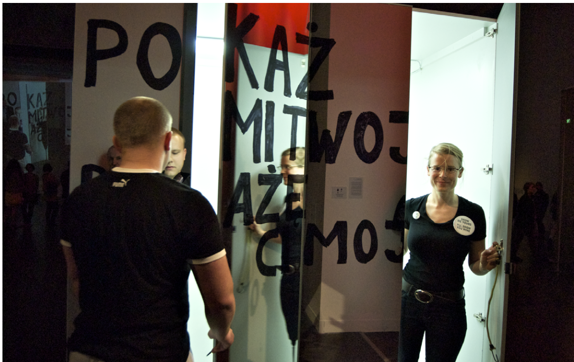
Pokaz mi twoje, pokaze ci moje (Show Me Yours, I'll Show You Mine), mirror wardrobe 200 x 229 x 120 cm, marker pen, button badge (performance/installation: Centre of Contemporary Art, Toruń, 18 May–16 September), 2012