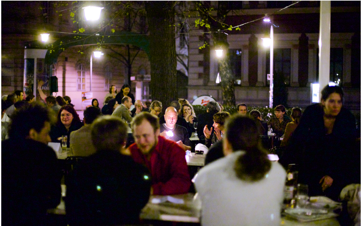
Closed Because of Pubic Hair ( Wegen Schambehaarung geschlossen ), monumental pavilion, plumber's hemp at the main entrance, table reservation (installation and action in lieu of a lecture: Secession , Vienna), 2009