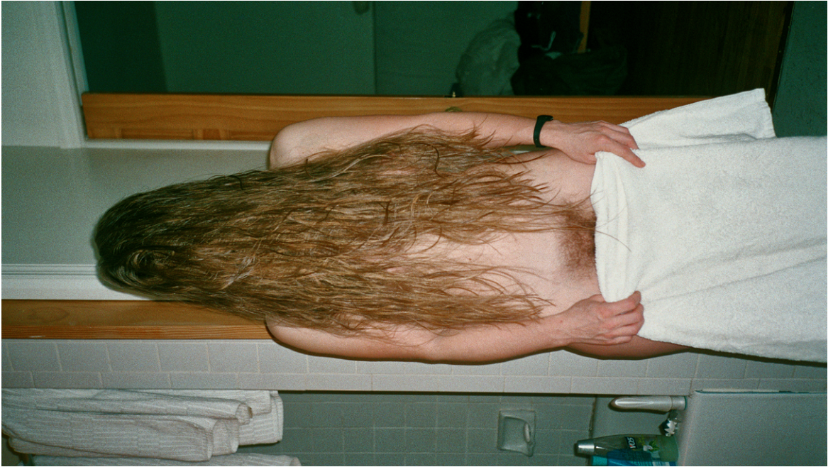
Letting My Hair Grow , six-month performance, New York, 2006-2007 [photograph: edition/3, image size 1100 x 620 mm, 2010]