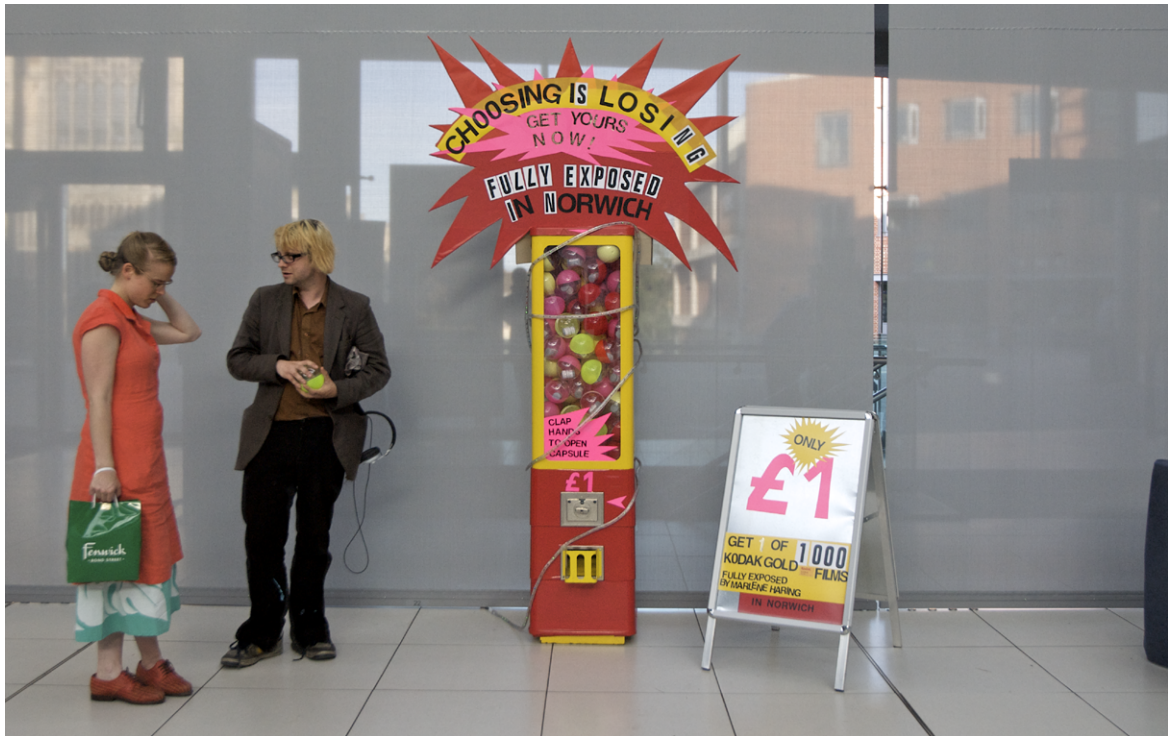
Choosing is Losing , 1,000 24-exposure 35mm colour films shot by Marlene Haring, not developed, numbered and signed, distributed via a vending machine (commission: Photo-ID: Photographers and Scientists Explore Identity, Norwich ), 2009