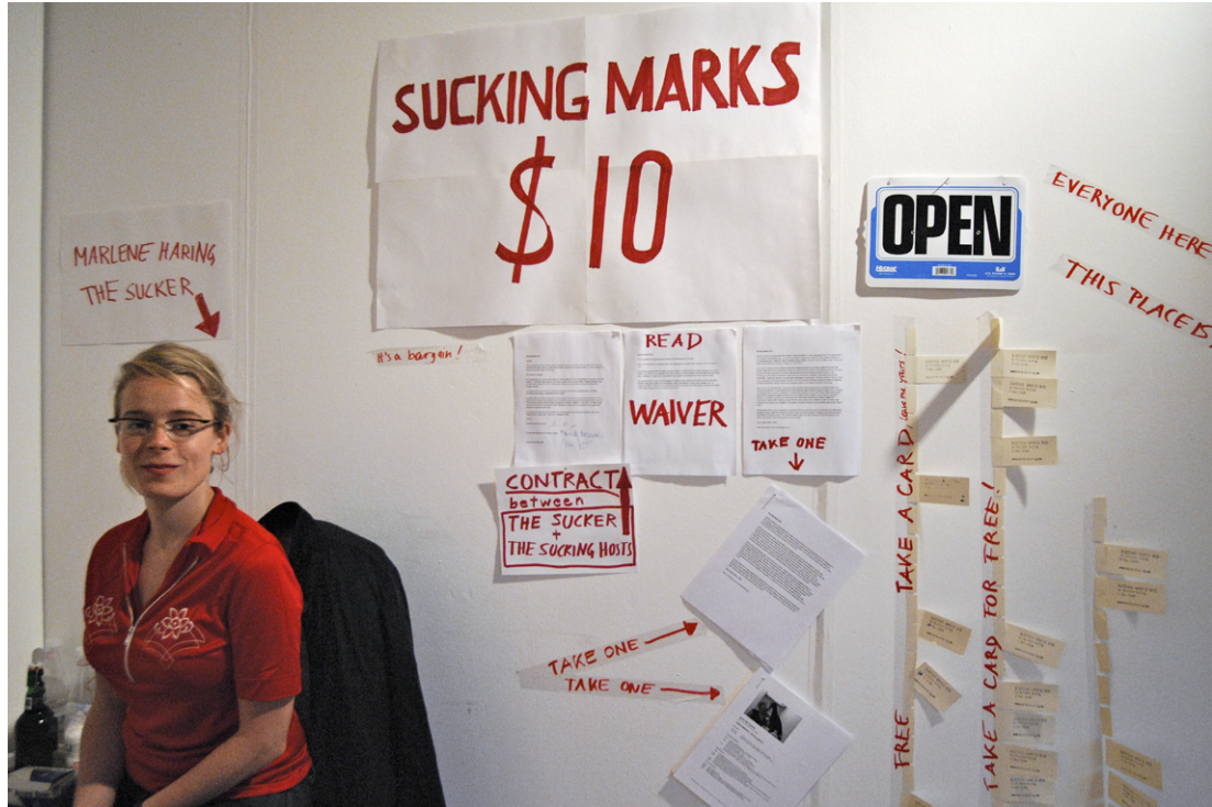
Sucking Marks $10 , commercial service, Scope Miami, 6-10 December 2006