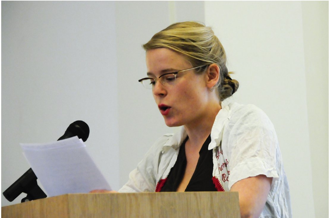
The Palais at 11.45am (Das Palais um elf Uhr fünfundvierzig), 135-minute performance, Galerie im Taxispalais, Innsbruck, 27 June 2009