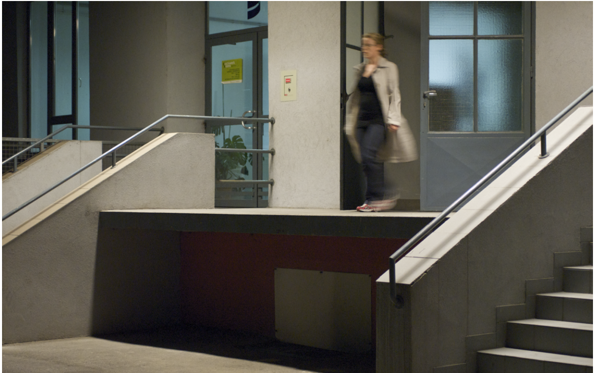
Rampenroutine (Ramp Routine) , 30-minute performance, approximately 60 repetitions of a series of actions on a loading ramp, Kunsthalle Krems, 3 October 2009