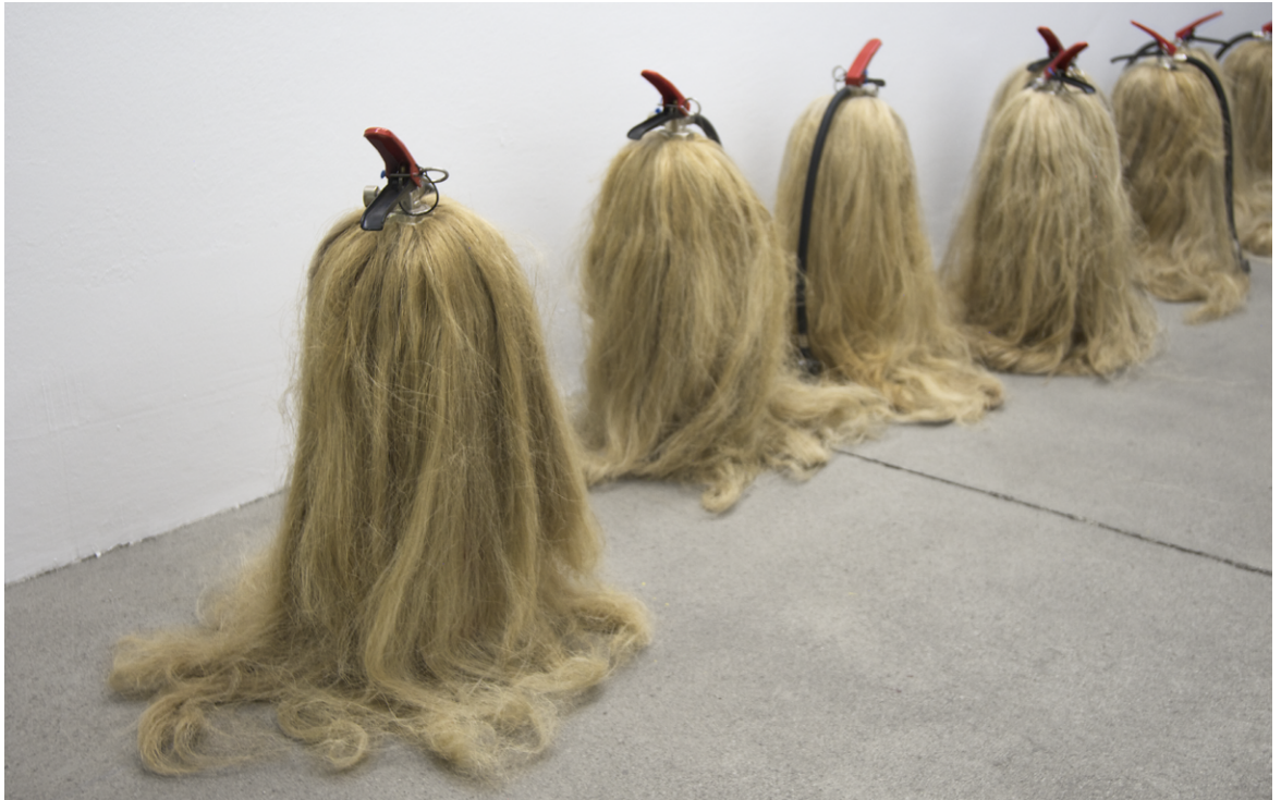
Hair Extinguisher (Haarlöcher) , 10 fire extinguishers, plumber's hemp (installation: Triennale Linz, OK Center for Contemporary Art), 2010