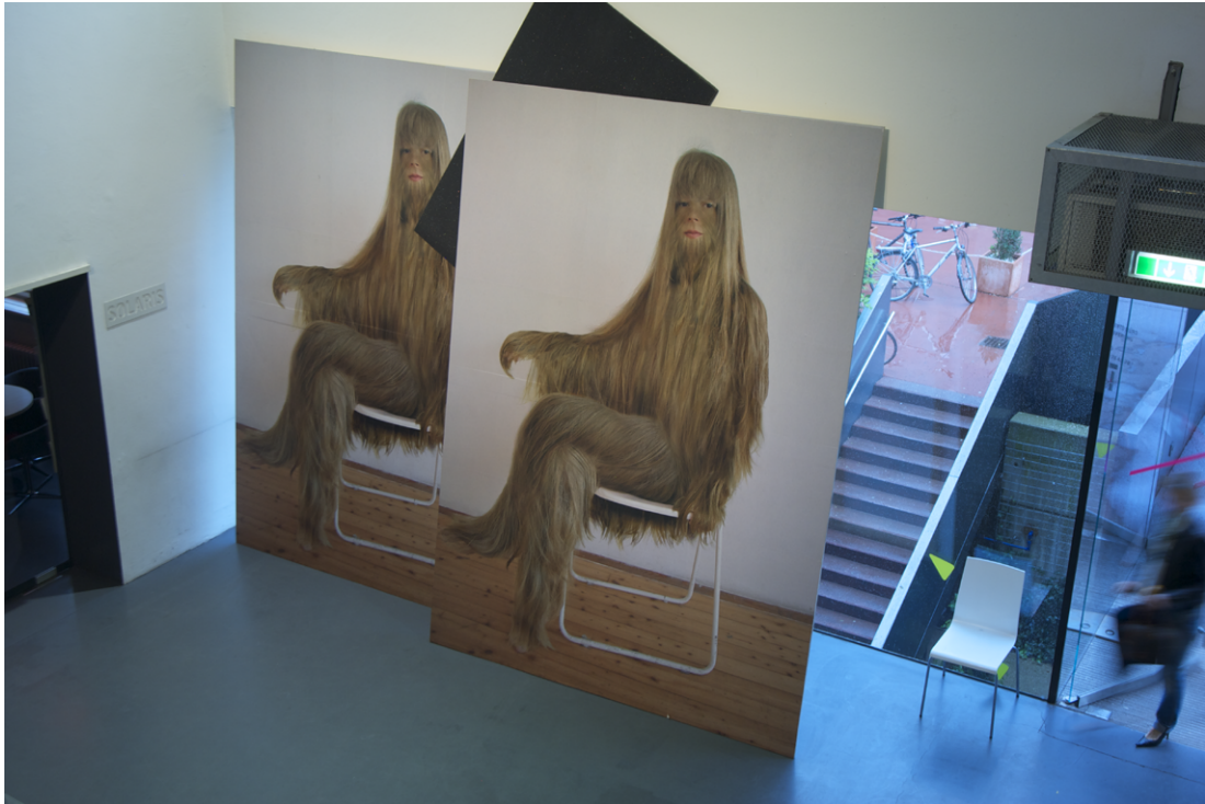
Because Every Hair is Different (Weil jedes Haar anders ist!) , billboard posters, 357 x 252 cm (installation: Triennale Linz, OK Center for Contemporary Art), 2010 [collection: Lentos Kunstmuseum, Linz]