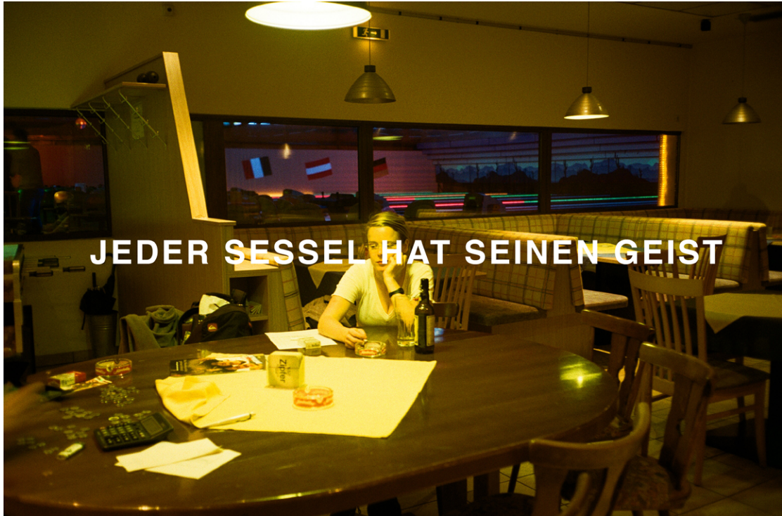
Living in Hope , three-week performance (for the Festival of Regions) as permanent regular in a local pub on the outskirts of Linz, Tornado Bowling Restaurant, 9–31 May 2009 [postcard, 104 x 147 mm, 2010]