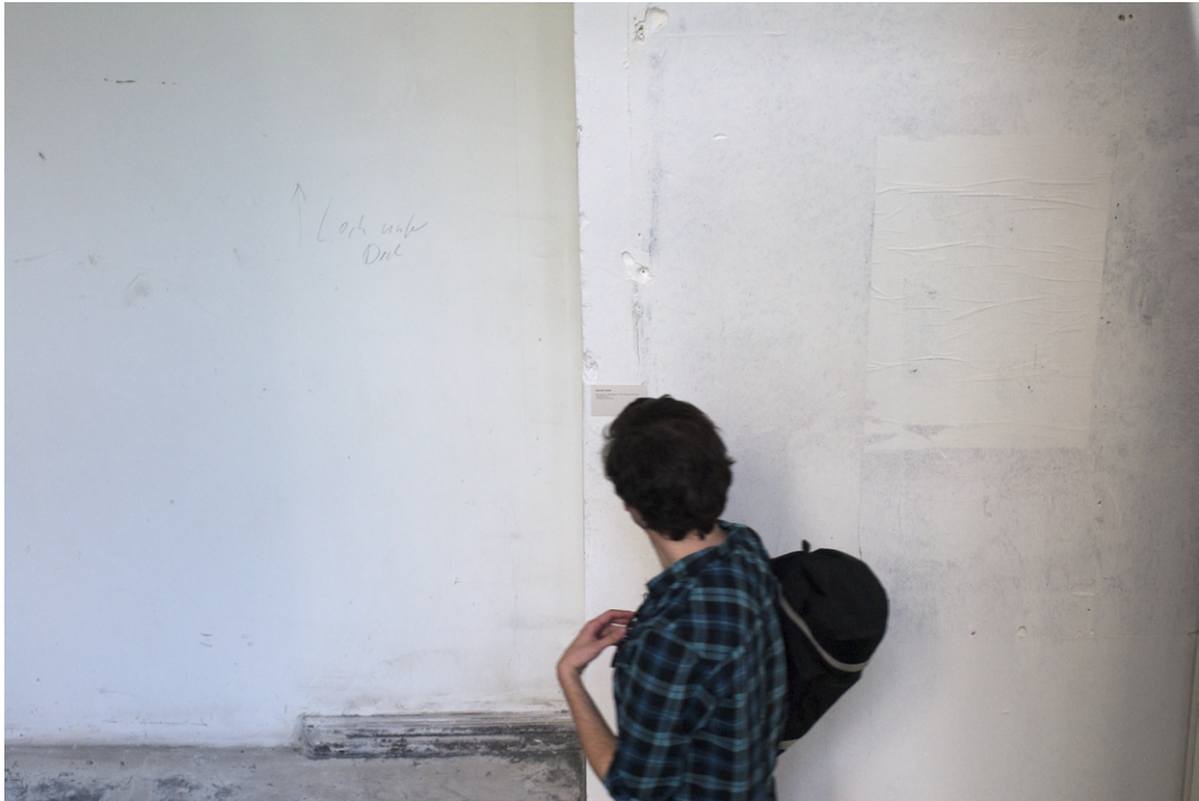
Niche Existence (Ifemale) Titleholder (Nischendasein (Titelträgerin)) , niches on a staircase, exhibition labels (installation/performance: 6th Berlin Biennale), 2010