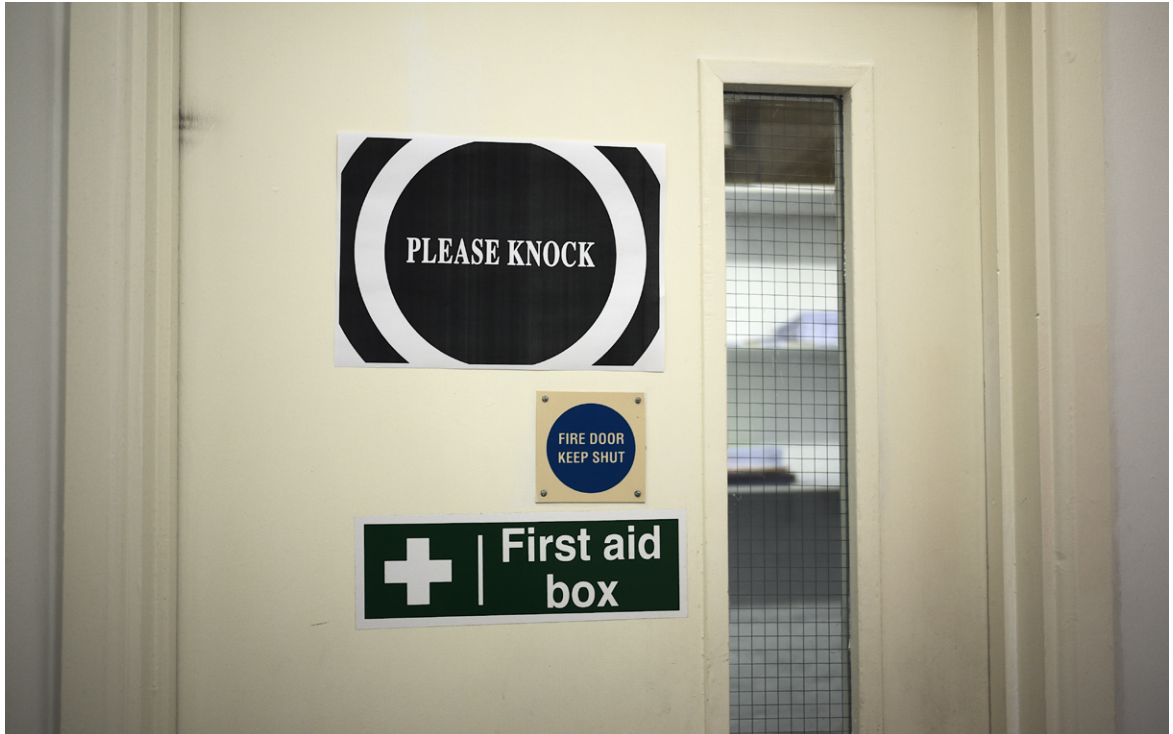
Secret Service Agency , temporary bureau, Modern Art Oxford, 27 November 2010