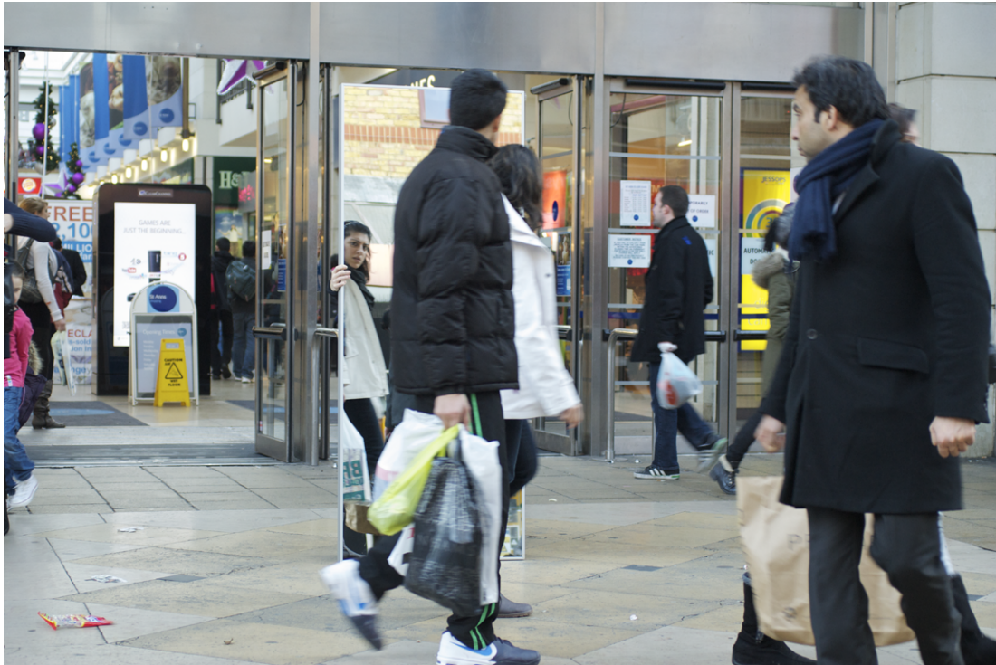
Mirror Holdings (Spiegelgesellschaft) , full-length mirror, various locations, London, 2011