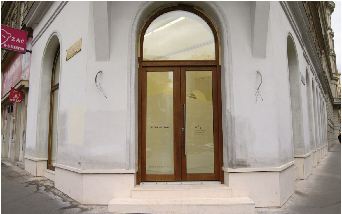
It's All a Façade (Alles Fassade) , exterior of an art gallery building [work stopped for the duration of the exhibition] (3-part installation/performance: Galerie Mezzanin, Vienna), 2005