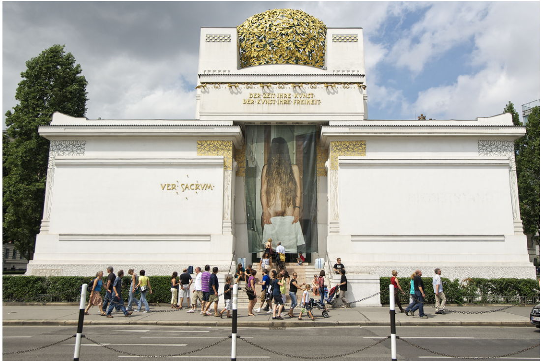
Letting My Hair Grow (Draußen wachsen [Growing Outside]) , monumental pavilion, banner, 4 x 7 m (installation: Secession, Vienna), 2010 [collection: Österreichische Galerie Belvedere] [photograph: edition/3, image size 350 x 235 mm, 2011]