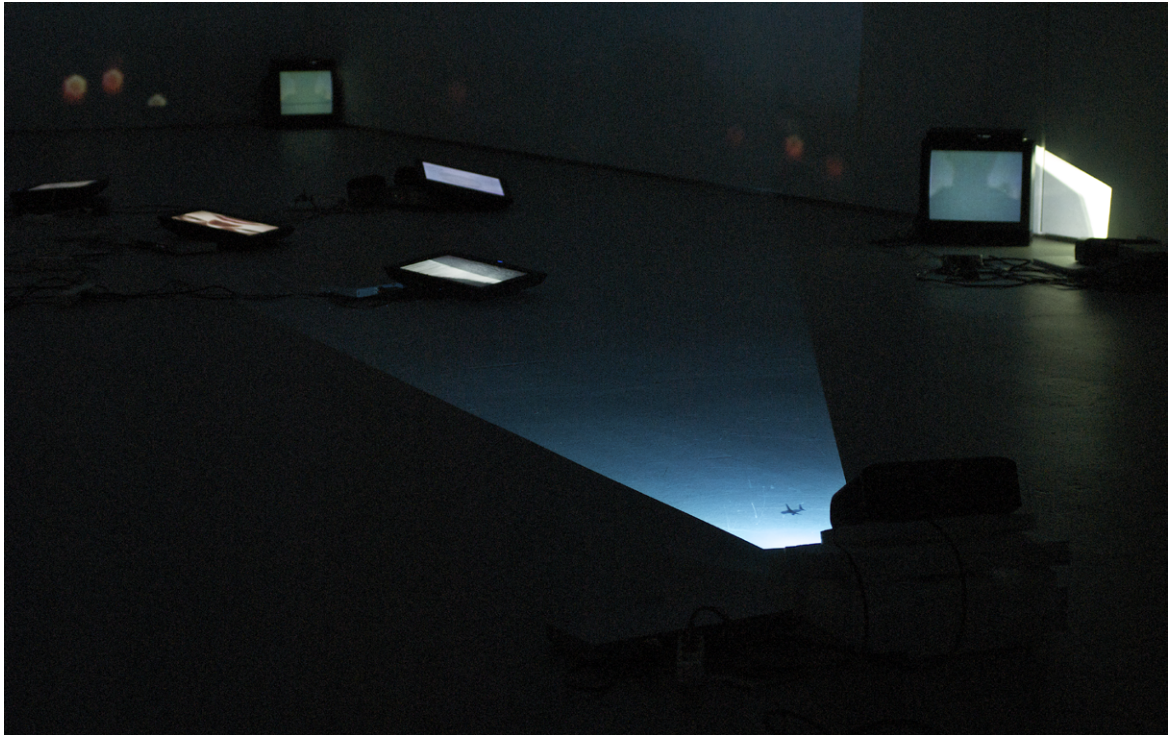
I won't paint myself into a corner (In die Ecke laß ich mich nicht drängen) , video loops, monitors, projectors, LOUD speakers (installation: Kunsthalle Krems), 2009