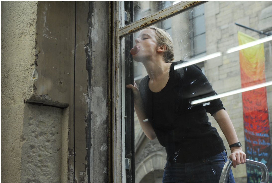
Lickingglass , 20-minute performance, Galerie Jocelyn Wolff, Paris, 29 October 2006