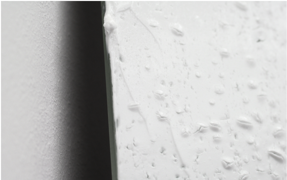
La Grande Marlène , mirror, Nivea Creme, 100 x 200 cm, 2006, detail