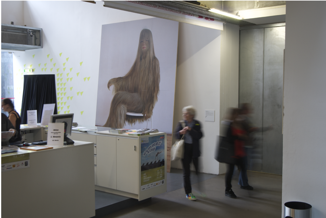
Because Every Hair is Different (Weil jedes Haar anders ist!) , billboard posters, 357 x 252 cm (installation: Triennale Linz, OK Center for Contemporary Art), 2010 [collection: Lentos Kunstmuseum, Linz]