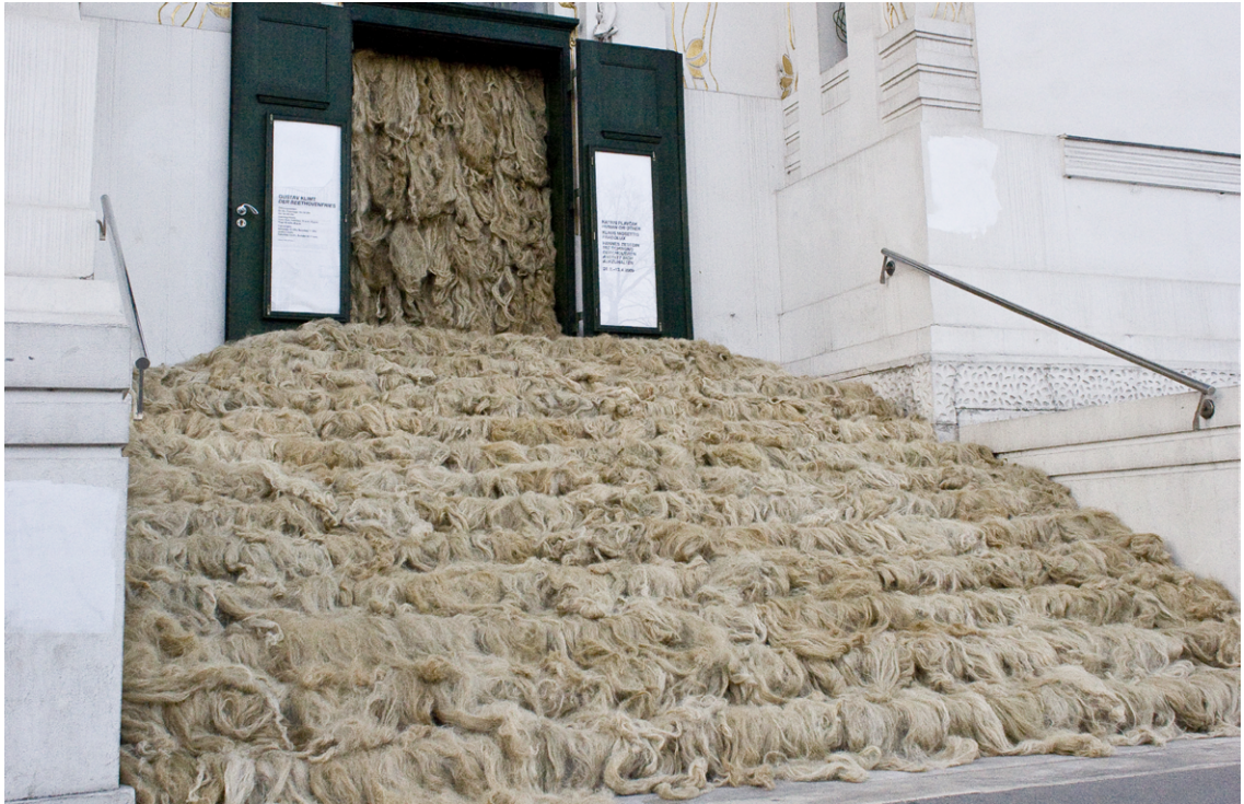
Closed Because of Pubic Hair ( Wegen Schambehaarung geschlossen ), monumental pavilion, plumber's hemp at the main entrance, table reservation (installation in lieu of a lecture: Secession, Vienna), 2009