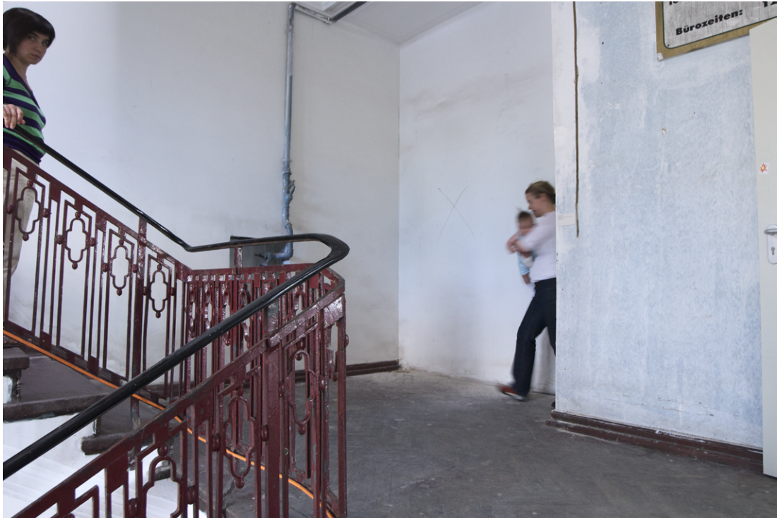
Niche Existence (IfFemale) Titleholder (Nischendasein (Titelträgerin)) , niches on a staircase, exhibition labels (installation/ performance: 6th Berlin Biennale), 2010